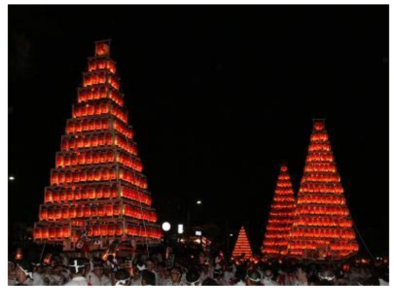
Tobata Gion Oyamagasa