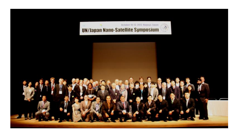
MIC2 final presentation, Oct. 10, 2012, Nagoya, Japan