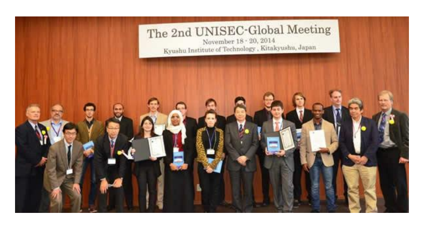
MIC3 finalists and reviewers, Nov 19, 2014, Kitakyushu, Japan