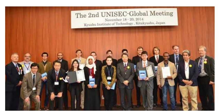
MIC3 finalists and reviewers, Nov 19, 2014, Kitakyushu, Japan