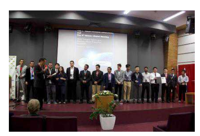
MIC4 finalists and reviewers, Oct. 21, 2016, Verna, Bulgaria