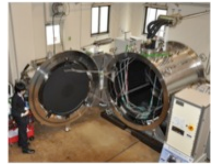
Fig. 1: (a) "Shaker" with 30 cm satellite (b) 1.5m thermal vacuum chamber

Kyutech is leading small-scale satellite testing in Japan. Approximately two-thirds of all Japanese small-scale satellites and many foreign small-scale satellites conduct environmental testing at CeNT.