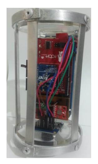
Figure-3 The Can-Sat

In Fig.3, the first can-sat system designed for observe a selected area by using simple camera module and system launched with a missile to reach desired altitude ,s shown.