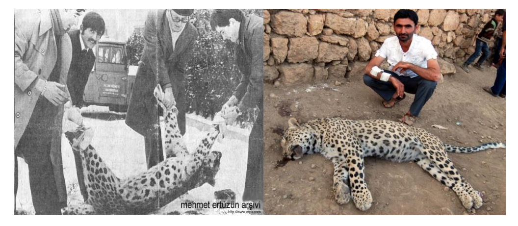
Figure-1 Tragic events in 1974 and 2013. This torture still continues

The system is designed by the students and researchers at ATILIM University and it is implemented by ASELSAN Company in Turkey.